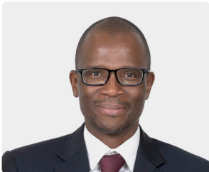
DAVID MASONDO Deputy Minister of Finance