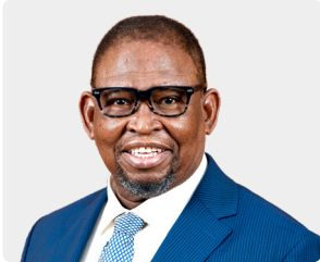
ENOCH GODONGWANA Minister of Finance