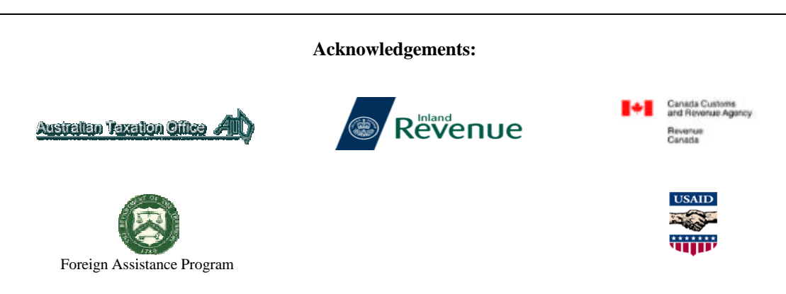
Pretoria 23 February 2000

http://www.sars.gov.za or http://www.finance.gov.za