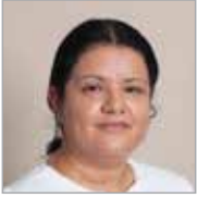
Panel member and speaker