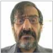
Panel member and speaker

Geraldine Fraser-Moleketi is a former Vice-President of the African Development Bank, where she helped mainstream gender in bank policies and operations. She also served as Minister of Public Service and Administration for two consecutive terms and was named the '2016 New African [magazine] Woman of the Year'. Geraldine holds a Master of Administration degree (Pretoria) and is a fellow of the Institute of Politics, Kennedy School of Government (Harvard). She completed a leadership course at Wharton Business School (Pennsylvania) and was recently awarded a Doctor of Philosophy (honoris causa) degree by the Nelson Mandela Metropolitan University.